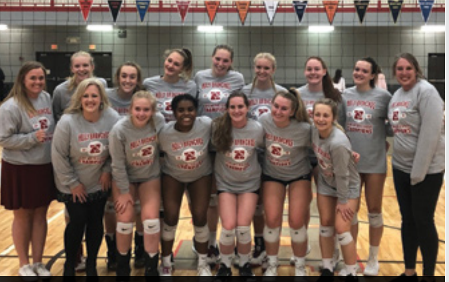
The Broncho girls volleyball team poses after winning a share of the Flint Metro League title.