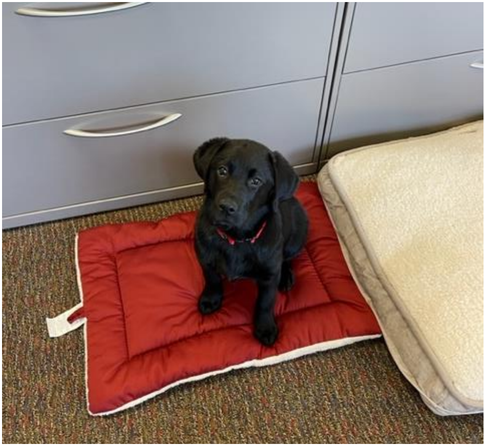
Cutline: Oakley takes a rest during pre-training at the Holly Area Schools Central Office.